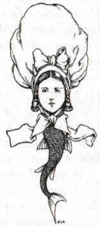
The merman king's old mother kept house for him.

The merman king had been for many years a widower, but his old mother kept house for him; she was a clever woman, but so proud of her noble birth that she wore twelve oysters on her tail, while the other grandees were only allowed six. Otherwise she was worthy of all praise, especially because she was so fond of the little mermaid princesses, her grandchildren. They were six beautiful children, but the youngest was the prettiest of all, her skin was as soft and delicate as a rose leaf, her eyes as blue as the deepest sea, but like all the others she had no feet, and instead of legs she had a fish's tail.