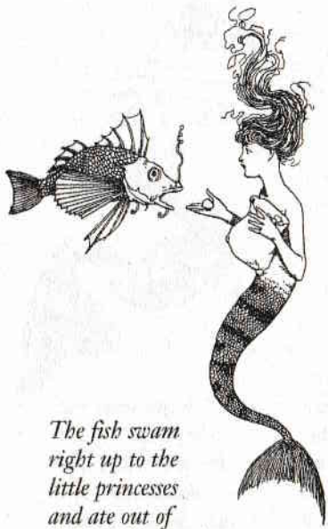
The fish swam right up to the little princess and ate out of their hands

The year after that the third sister went up, and being much the most venturesome of them all, swam up a broad river which ran into the sea. She saw beautiful green, vine-clad hills; palaces and country seats peeping through splendid woods. She heard the birds singing, and the sun was so hot that she was often obliged to dive, to cool her burning face. In a tiny bay she found a troop of little children running about naked and paddling in the water; she wanted to play with them, but they were frightened and ran away. Then a little black animal came up, it was a dog, but she had never seen one before; it barked so furiously at